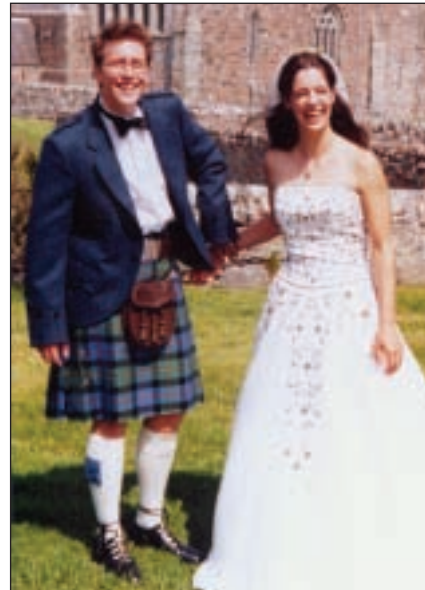
A trans man and his bride

Gender dissonance is sometimes evidenced from an early age by, for instance, non-stereotypical choices of dress and leisure pursuits. Phenotypically female children may refuse to wear dresses, and phenotypically male children may be drawn to flowery, girlish clothes. They may 'borrow' clothes from their mother or their sister.